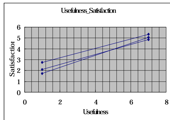
Figure 3. The difference of the relation between end-user satisfaction and perceived usefulness based on the level of end user expectation

This analysis reports on the difference of the relation between end-user satisfaction and perceived usefulness based on the level of end user expectation. And the change rate of end-user satisfaction on perceived usefulness is higher in the high level of user expectation rather than both low and middle level of user expectation. Therefore, different strategies are needed to satisfy end-users that have different level of expectations.