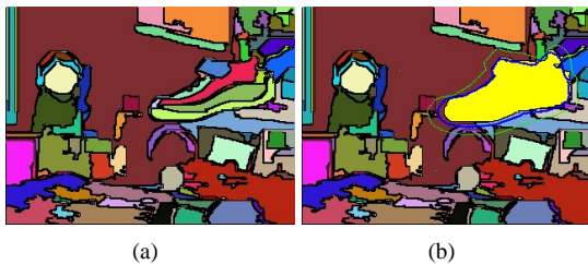
Figure 2. (a) original image (b) selected inner segments

Fig. 2 shows the result. Yellow regions are the combination of segment included in the template in the position. The blue line is actual template contour, and the green line is the extended template edge to tolerate slightly bigger scale.