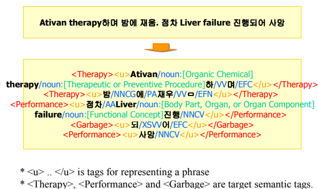
Fig. 2. An example of semantic phrase tagging